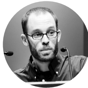
Daniel Domscheit-Berg (Wikileaks)